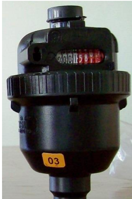
20 mm “Elster Kent Model KSM” Illustration 3