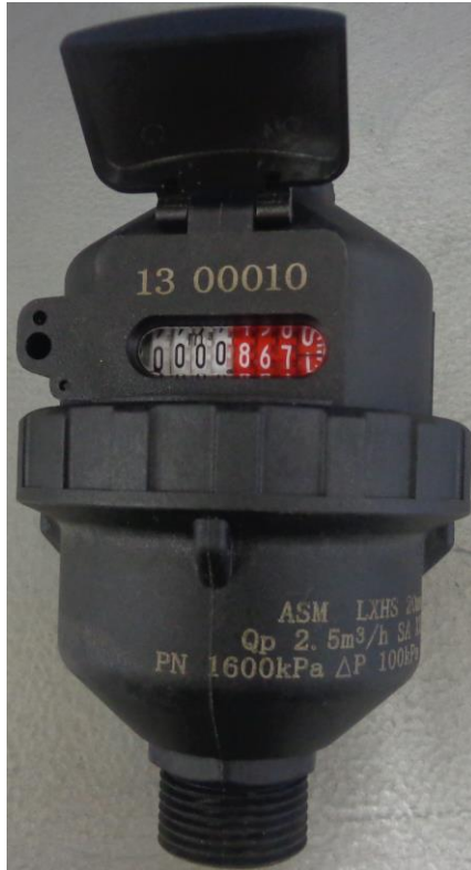
“20 mm ASM Model LXHS”