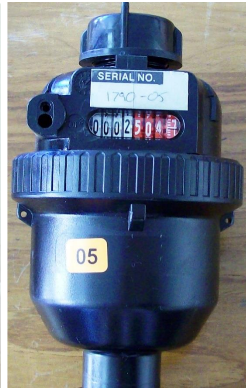
25 mm “Elster Kent Model KSM”