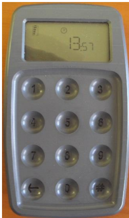
Illustration 2 Photograph of the UIU